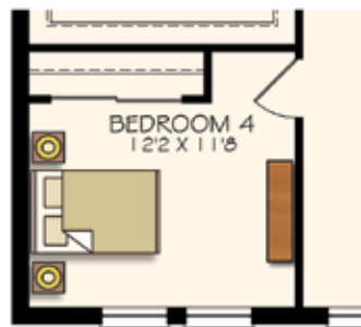
OPTIONAL BEDROOM 4 ILO FLEX