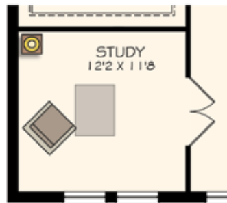
OPTIONAL STUDY ILO FLEX