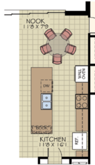
OPTIONAL GOURMET KITCHEN