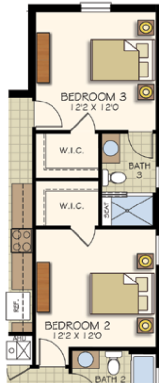
OPTIONAL BATH 3