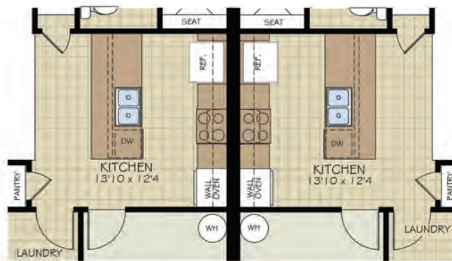
OPTIONAL GOURMET KITCHEN