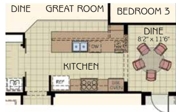
Opt. Gourmet Kitchen