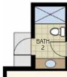
Opt. Door at Bath 2