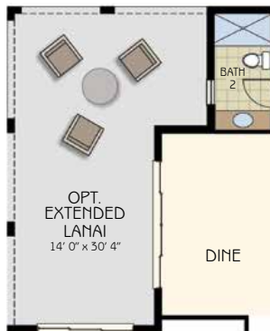
Opt. Extended Lanai